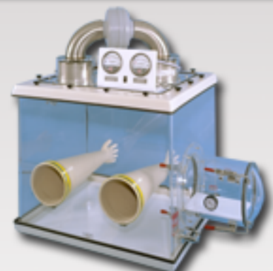
800-CLC, Closed-Loop HEPA