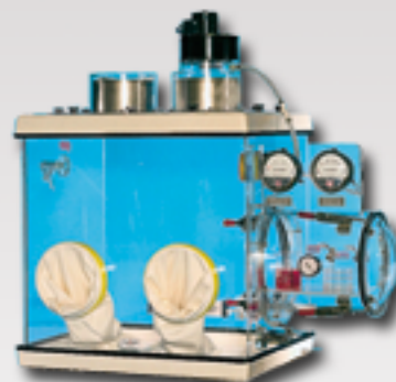
800-HEPA/D, Double HEPA